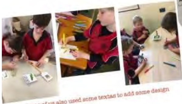
Some of us also used some texas to add some design