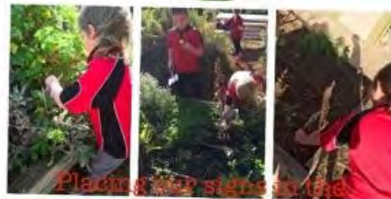
Placing our signs in the garden for the vegetables