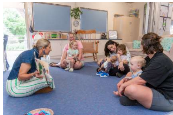
"Global Learning in a Family Setting"